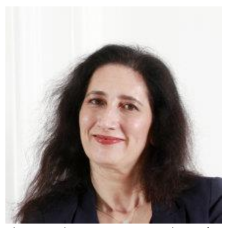
The French Competition Authority's Isabelle de Silva.

The deal in France only moved forward when the French Competition Authority ordered Google to negotiate after the search giant simply stopped publishing snippets belonging to local publishers after a copyright law change prompting them to pay.